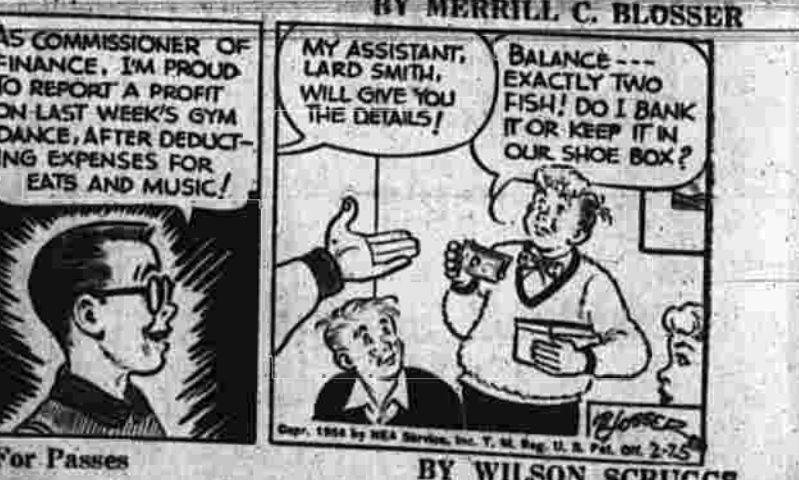
Request For Passes