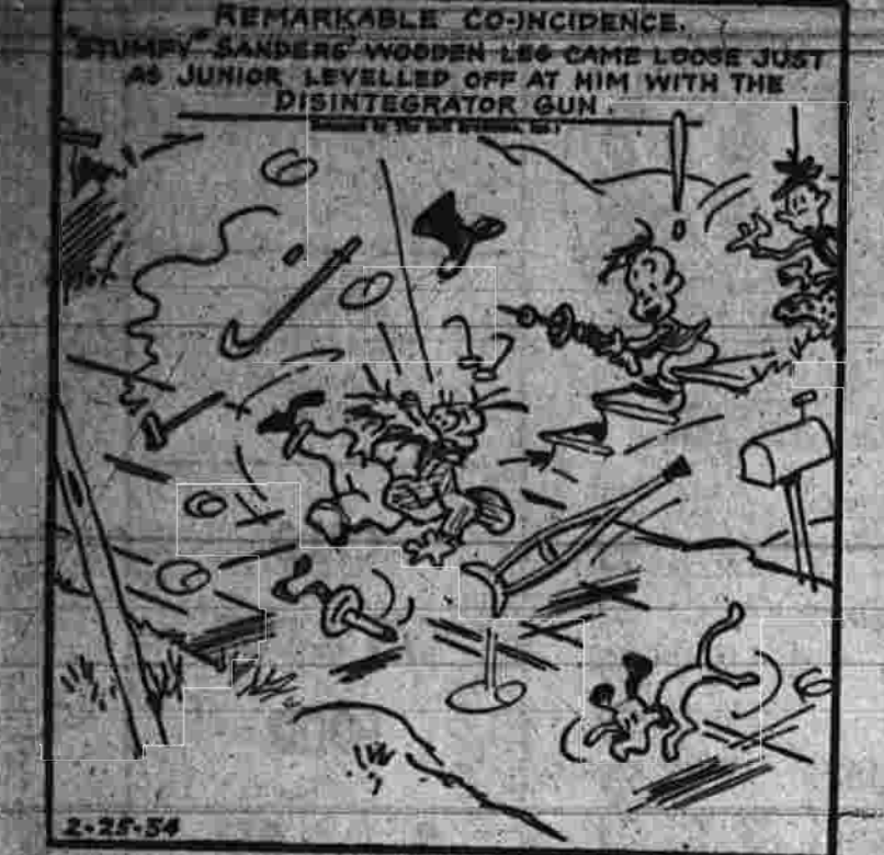
REMARKABLE COINCIDENCE. SANDERS' WOODEN LEG CAME LOOSE JUST AS JUNIOR LEVELLED OFF AT HIM WITH THE DISINTEGRATOR GUN.