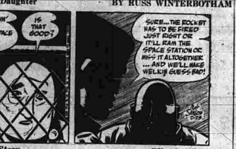
The Old Story