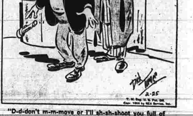
It's A Game