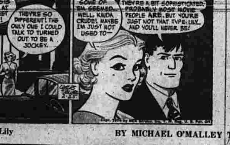
Not For Lily