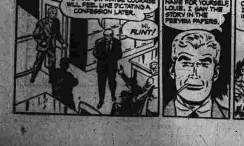
THAT'S ALL BOYS